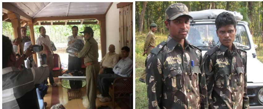
Fig. 5. Distribution of dress and cap to tourist road guides (Photo dated 18.04.12).

Distributed dress and cap to 14 tourist road guides of Achanakmar Tiger Reserve (Fig. 5 ). Constructed stage for cultural activities, eco-cottage and tourist information center at Shivtarai (Fig. 6). Constructed nature trail of two km in Kota range (Gattumur to Bade Kachhar) and six km in Lamni range (Kachandi Jalprapat to Rahiama) of buffer zone of Achanakmar-Amarkantak biosphere reserve.