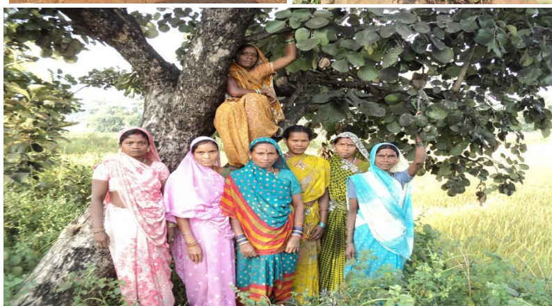
Fig. 12. Lac cultivation and collection by SHG at Shivtarai (Photo dated 18.10.12)