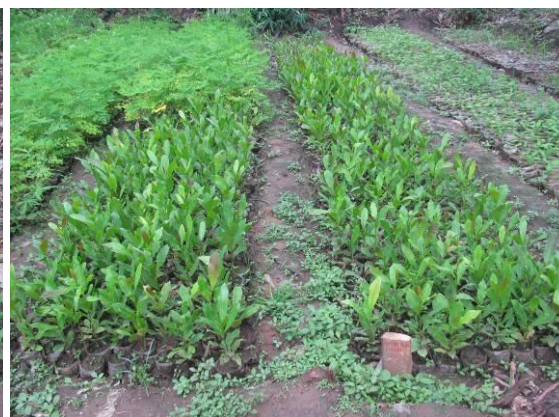
Khodri (Photo dated 18.06.12)