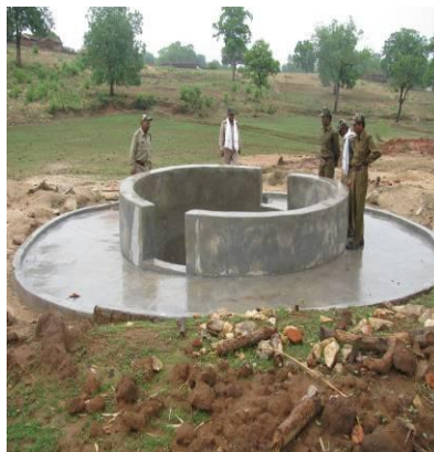
Bagdhra (Photo dated 19/12/12)