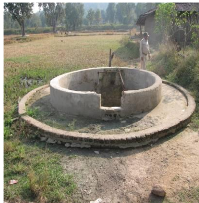
Bhosko (Photo dated 19/12/12)