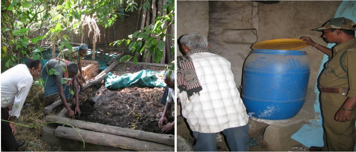
Fig. 13. Construction of vermicompost unit by SHG at Shivtarai. (Photo dated 22.11.12)