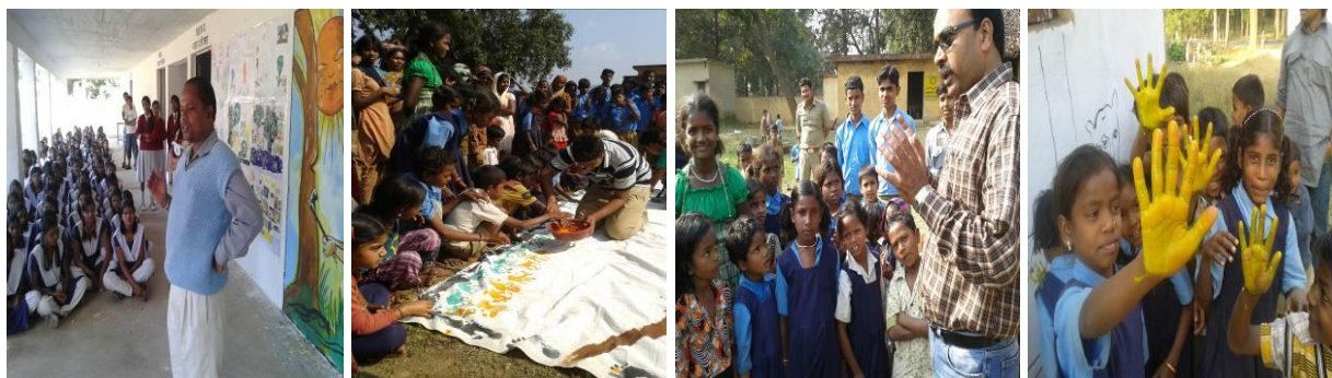
(Photo dated 05.12.12) (Photo dated 15.12.12) (Photo dated 15.12.12) (Photo dated 17.12.12)