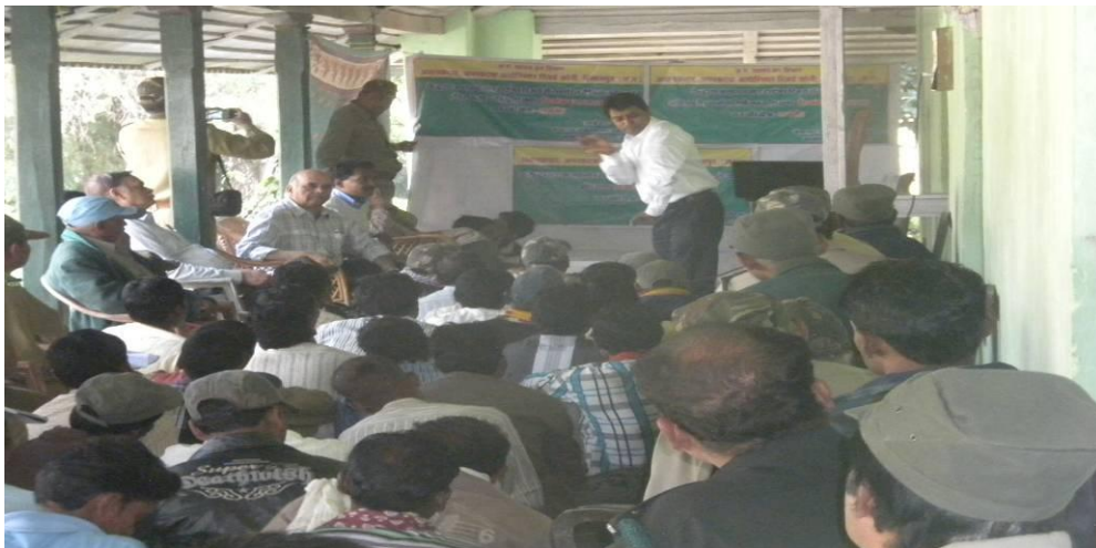
Fig. 14. Training on seedling collection and raising of nurseries at Belghana. (Photo dated 08.03.12)

Conducted training camp on skill development for seedling collection and raising of nurseries at Khodri and Belghana (Fig. 14 ). Organized two training programmes on driving and cooking for drivers of tourist vehicles and cooks of hotel/dabha respectively of Achanakmar Tiger Reserve (Fig. 15).