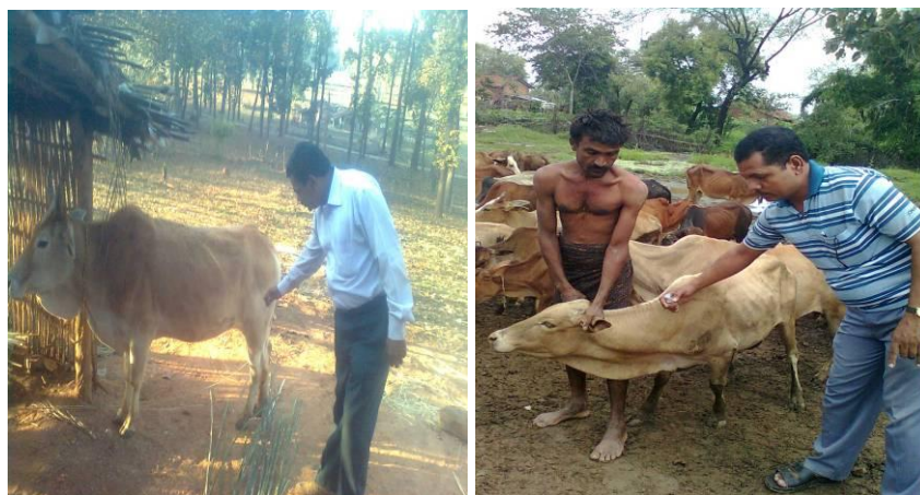
Fig. 8. Vaccination of domestic cattle (Photo dated 05.03.12)