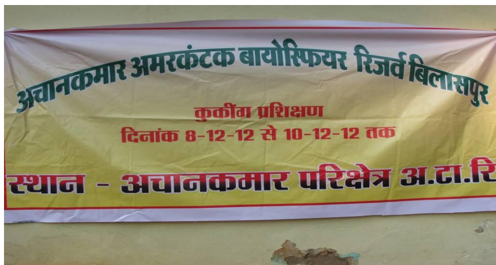
Fig. 15. Cooking training in Achanakmar-Amarkantak biosphere reserve. (Photo dated 09.12.12)