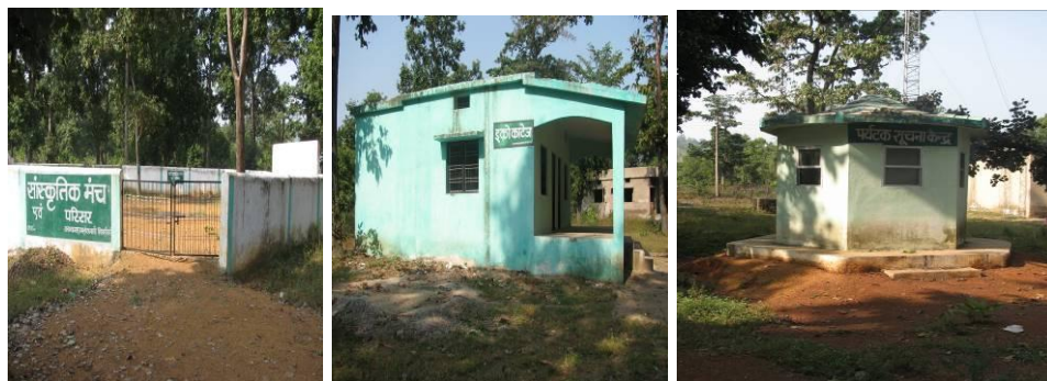
Fig. 6. Construction of cultural stage, eco-cottage and tourist information center at Shivtarai (Photo dated 19/12/12)