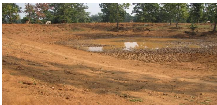
Fig. 10. Pond for pisciculture at Karwa (Photo dated 16.12.12).

Established micro enterprises for collection and processing of Mahul leaves at Shivtarai by Mahamaya self help group (SHG). Constructed one pond for pisciculture at Karwa by local SHG (Fig. 10). Collected seeds of local fruit trees and raised seedlings in nurseries at Belghana and Khodri and carried out marketing with the assistance of local SHG (Fig. 11). Promoted lac cultivation and marketing through SHG at Shivtarai (Fig. 12). Collected and processed honey through local SHG, Amadob. Collected and prepared amchur and pickle based on the local fruits available by the Saraswati Mahila SHG, Achanakmar and Ma Sharad SHG, Amadob. Constructed vermicompst unit through SHG, Shivtarai (Fig. 13 ). Collected and processed medicinal plants through SHG, Shivtarai and Amadob.