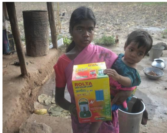
Fig. 7. Distribution of solar lantern among the villagers of Birarpani and Chhirhatta (Photo dated 16.04.12).

Distributed 20 solar lanterns among the villagers of Birarpani and chhirhatta (Fig. 7). Vaccinated domestic cattle of 22 villages, namaley Sarasdol, Vidawal, Shivalkhar, Tilaidabra, Chhapparwa, Achankanmar, Ataria,Kuba, Virapani, Amadob, Ranjiki, Chhirhatta, Lamni, Aorapani, Patprha, Chhuiha, Sargod, Kurdar, Chhikladabari, Bagdhara, Bhosko and Bhanwartang, for protection of pests and pathogens (Fig. 8). Constructed three wells, one each in Tatidhar, Bhosko and Bagdhara (Fig. 9). Constructed four raptas on Rajak to Boiraha raod of Acahnakmar-Amarkanatak biosphere reserve.