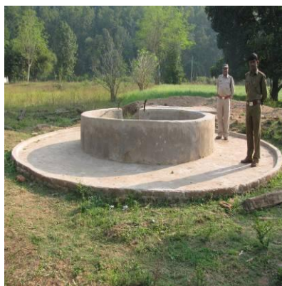
Tatidhar (Photo dated 19/12/12)