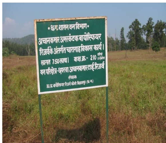
Compartment No. 210 (Photo dated 15.12.12)