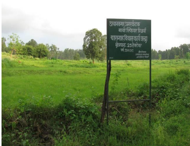
Compartment No. 152 (Photo dated 28.8.12)

A total of 50 ha grass meadows developed in Achanakmar Tiger Reserve, out of which 25 ha in Jalda (Compartment No. 152) of Achanakmar Range and 25 ha in Borkarakachhar (Compartment No. 210) of Chhaparwa Range (Fig. 1). These grass lands have taken two years from preparation of lands, sowing of seeds, weeding and application of biofertilizer (vermicompost). The growth of grasses has been observed to be satisfactory, which can serve as food for herbivore animals.