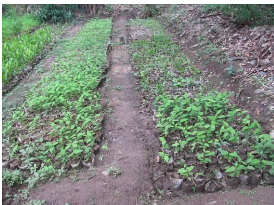
Belghana (Photo dated 15.06.12)