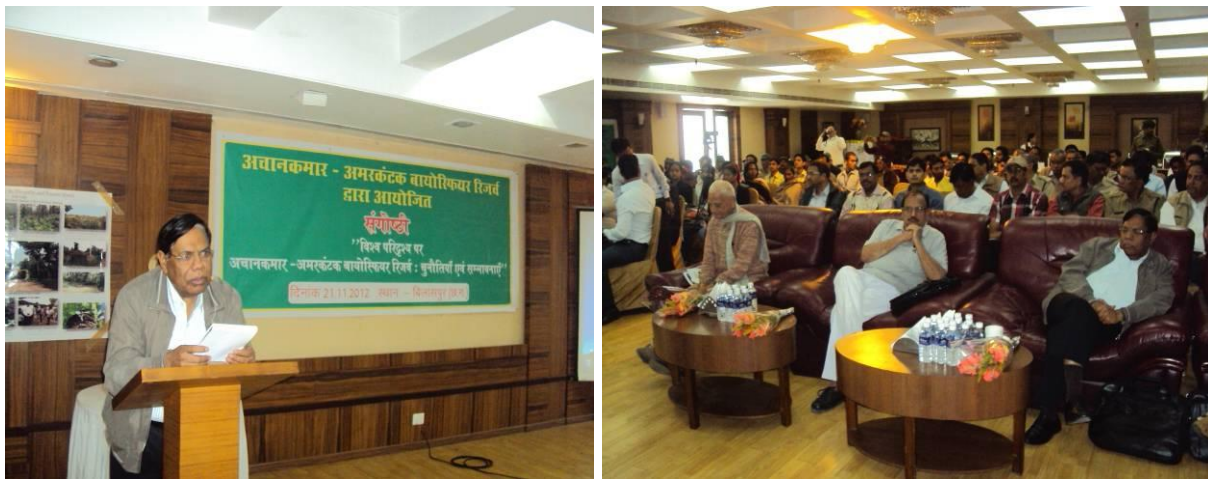
Fig. 3 . Seminar on “Achanakmar-Amarkanatak Biosphere Reserve on World Net Work (Photo dated 21/11/2012)

One day seminar, entitled “Achanakmar-Amarkanatk Biosphere Reserve on World Net Work : Prospects and challenges” was organized on 21 st November at Bilaspur, where all the Forest Officers, scientists, professors, NGOs, students and rural peoples from biosphere reserve were assembled and taken part in discussion (Fig. 3 ). Organized workshop at Lamni and visited students of Sirpur School. Organized environmental education programmes in 10 school of Achanakmar-Amarkanatk Biosphere Reserve (Fig. 4).