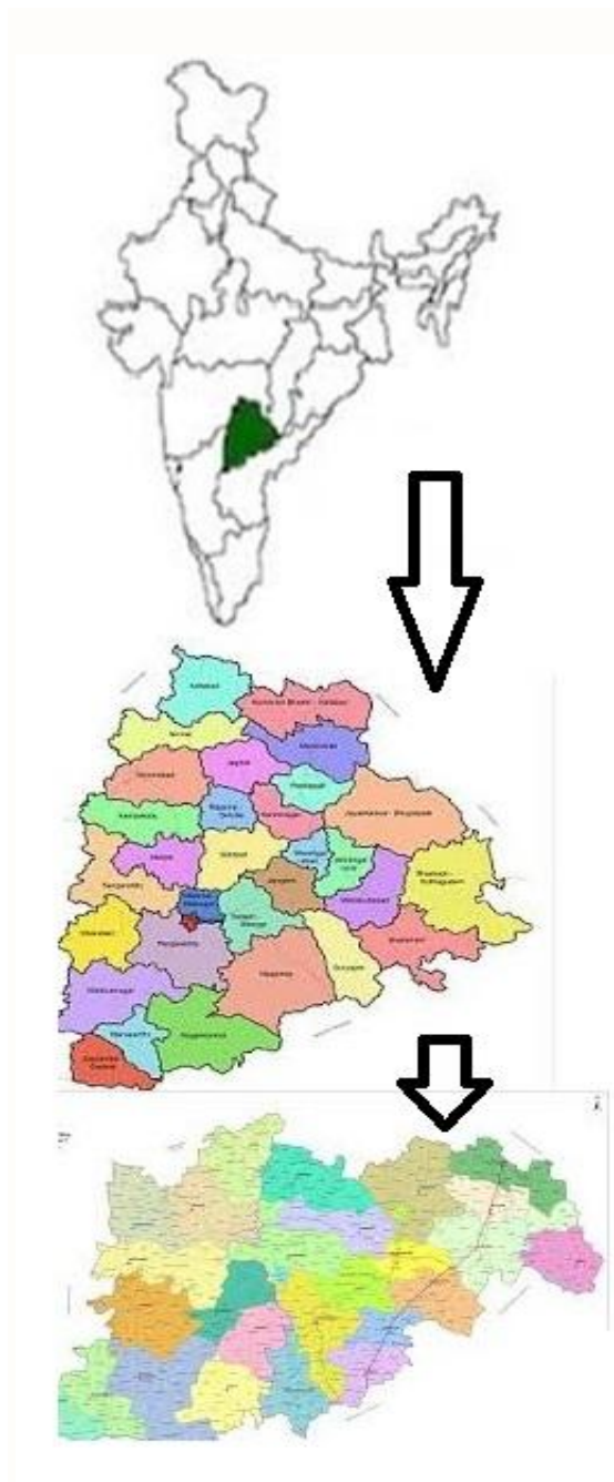
Figure 1: Study location (India to Mahabubnagar)

In the current outcome, the four common dye preparation procedures, part used, viability, purpose of usages discussed with