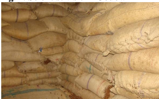
Fig . 3. Stored Bags of mahua flowers in Godow