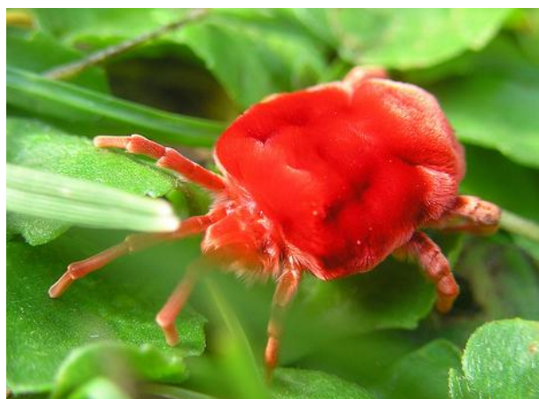
Red velvet mite- Trombidium grandissimum

the soil during night. They hibernate during winter. They secrete anti fungal oil. Also, their haemolymph contain antifungal properties.