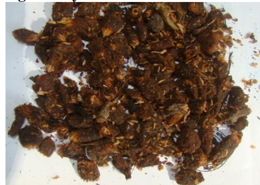
Fig. 5. Damaged Mahua flowers