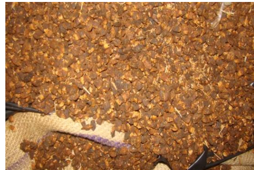
Fig . 4. Dry Mahua flowers in Godown