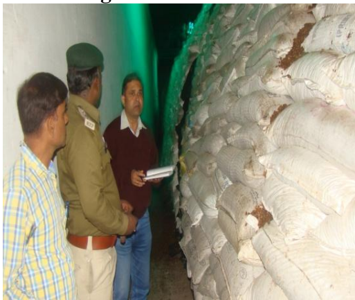
Fig. 2. Scientist visit in Godown