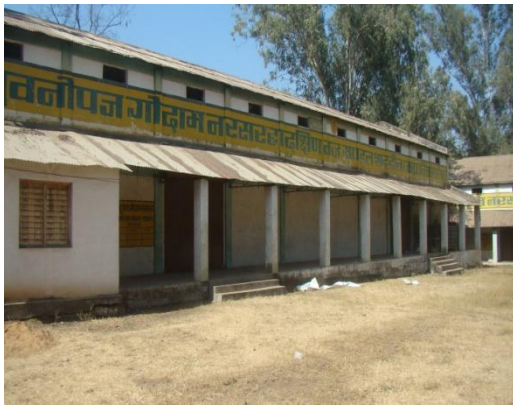
Fig. 1. View of Godown