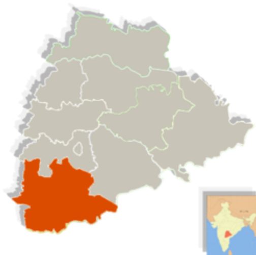
Figure 1: Specific Study area Mahabubnagar District, Telangana State, India.

enjoys warm climate. In northern Telangana tropical rainy type of climate prevails. Hot Steppe type of climate is noticed in the southern parts of the State. In Tropical Rainy type, the mean daily 0 temperature is above 20C with an annual rainfall of 150 to 200 cms, mostly in summer and South-West monsoon. In the Hot Steppe type, the mean daily temperature is 18C and less. In the state of Telangana Maximum temperature in the summer season varies between 37C and 44C and minimum temperature in the winter season ranging between 14C and 19C. The State has a wide variety of soils and they form into three broad categories - red, black and laterite. The type of forests met within Telangana, as per the classification of Champion and Seth (1968) are Tropical moist deciduous forests, Southern dry deciduous forests, Northern mixed dry deciduous forests, Dry savannah forests and Tropical dry evergreen scrub 14 . In Telangana state there is about more than 20 tribes were recorded. Commonly they are located hilly and interior forest areas. The research report focusing on a number of the important wild food plants, which need to be documented for food security in future.