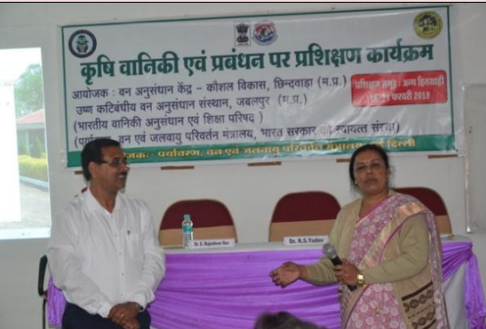
Discussion during the presentation