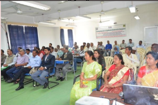
Officers and participants during the lecture session