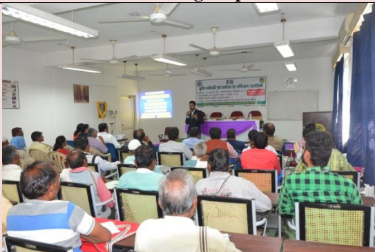
Trainees listening about agri-horti medel suitable for Chhindwara district.