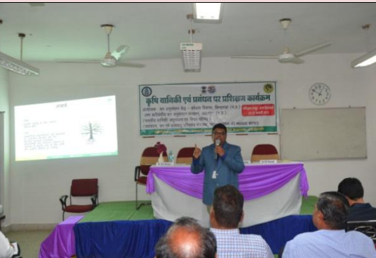
A view of technical session