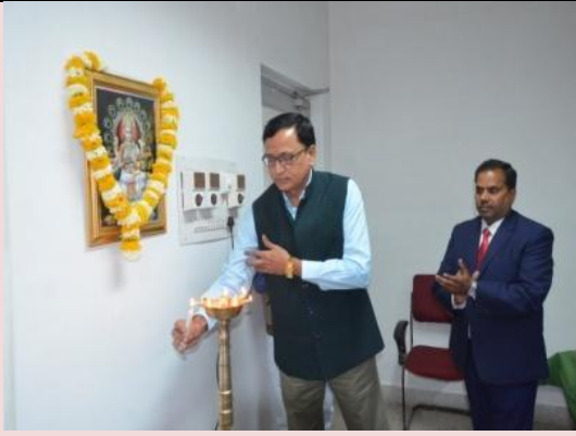
Lighting of lamp during inaugural session