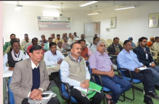
Overview of technical session