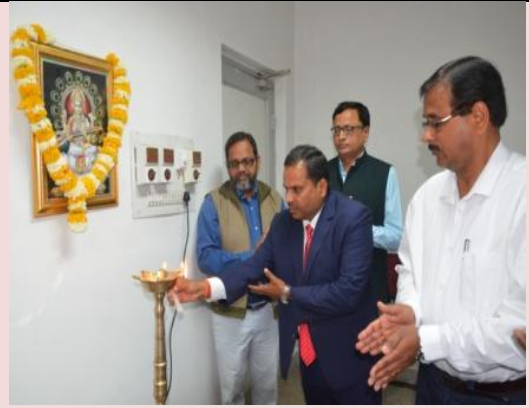
Dignitaries inaugurated the event