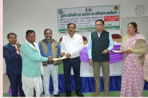
Distribution of certificates during the valedictory session