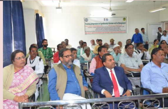
Dignitaries during the technical session