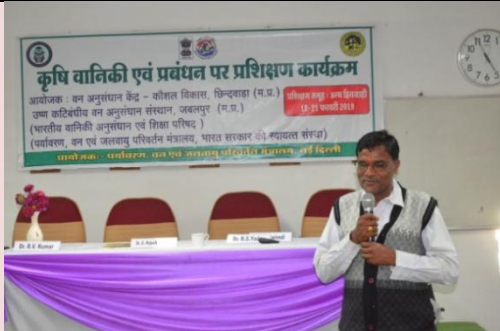
Feedback by the trainees