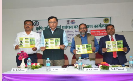
Release of brochure on Agroforestry and its management during the event