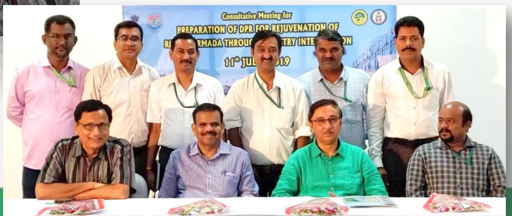
Pictorial glimpses of the workshop